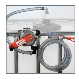
Rotary Hand Pump Tote Kit Part # F00332B00