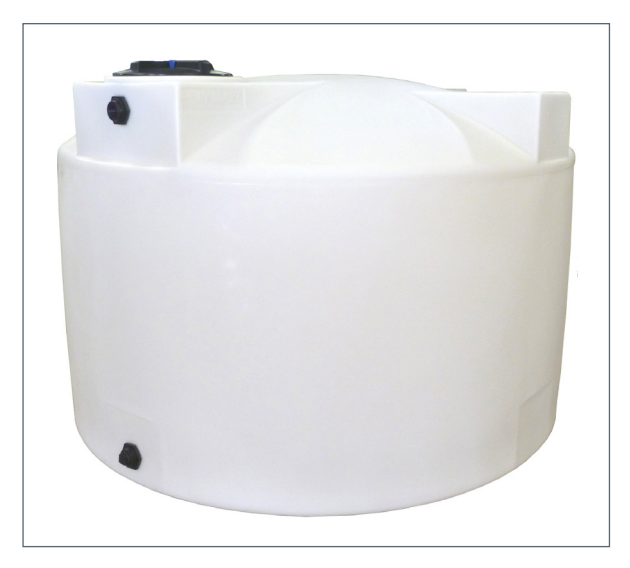
Above Ground Poly Tanks