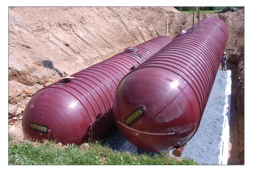
Xerxes Below Ground Fiberglass Tanks

Northwest Pump can provide for all your DEF equipment needs from underground or aboveground tanks, commercial and retail dispensing, and selfcontained units.